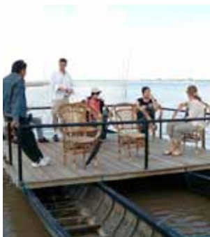
La Folie Lodge