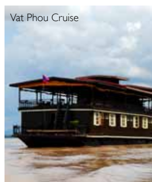
Vat Phou Cruise